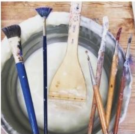
Top: Julie working Middle: Encaustic paint in its solid form Bottom left: Encaustic Medium with brushes Bottom right: Mixing colours up on the hotplate

Time stands still, and I have no idea how many hours or minutes are passing. I simply go with what feels right until I'm compelled to stop. Sometimes a piece is finished in a session, other times it can take months.